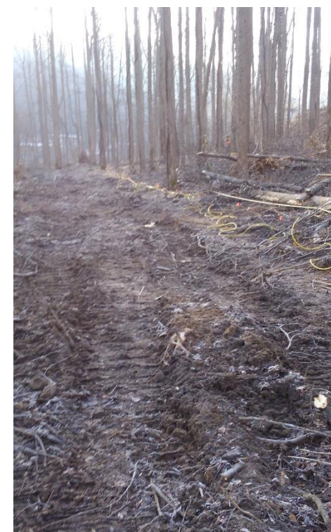
Figure 3. Image showing the site conditions as well as an ER line traversing from the top of the image to the right. Trees were felled to permit some access for geophysical surveys and heavy equipment operators for excavation.

Survey Results: Interpretations (Figure 2) for locating the diesel plume worked off two principles: 1) all hydrocarbons are non-polar molecules and thus they are resistive to electrical current and 2) diesel is an LNAPL and will be notably floating atop the saturated zone in the sandy river (fluvial) alluvial deposits. Based on these two principles, the expected observation would be a decrease in conductivity at or above the saturated zone. The dashed ellipses in the cross section above (Figure 2) indicate the expected signatures in this scenario and were picked as targets to be investigated with a direct-push technology boring program at the site.